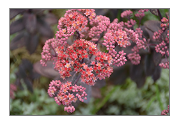
Night Embers Stonecrop flowers