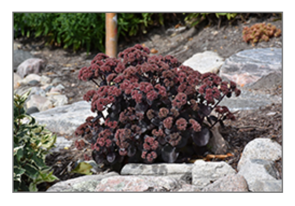
Night Embers Stonecrop in bloom

Night Embers Stonecrop is recommended for the following landscape applications;