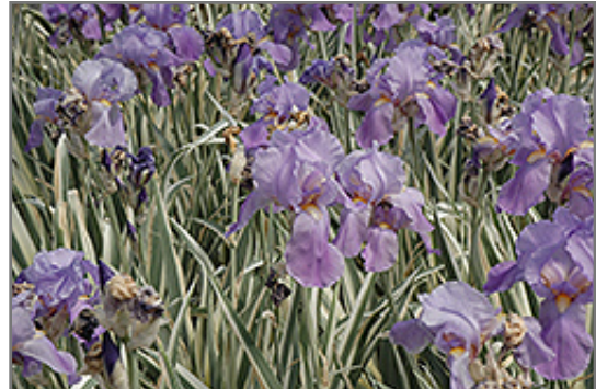
Variegated Sweet Iris flowers