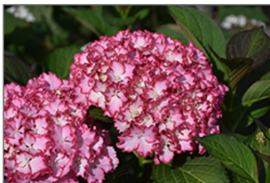
Seaside Serenade Fire Island Hydrangea flowers

Seaside Serenade Fire Island Hydrangea is recommended for the following landscape applications;