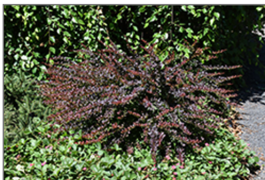
Lava Nugget Barberry