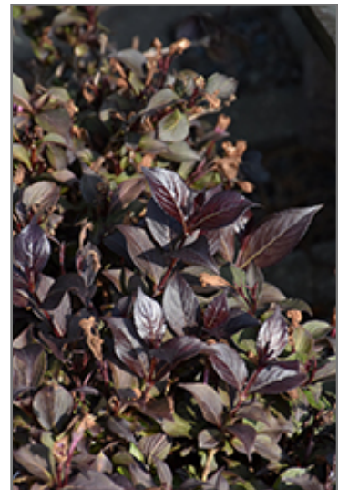
Coco Krunch Weigela foliage