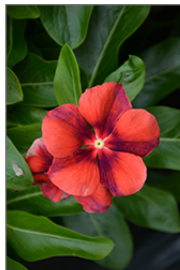
Tattoo Tangerine Vinca flowers

Tattoo Tangerine Vinca is recommended for the following landscape applications;