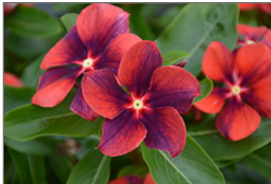
Tattoo Tangerine Vinca flowers