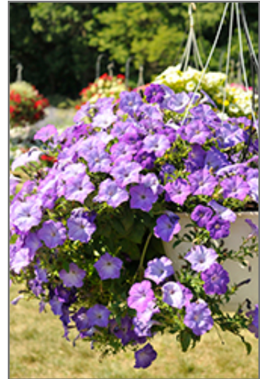
Easy Wave Lavender Sky Blue Petunia in bloom

Easy Wave Lavender Sky Blue Petunia is a fine choice for the garden, but it is also a good selection for planting in outdoor containers and hanging baskets. Because of its trailing habit of growth, it is ideally suited for use as a 'spiller' in the 'spiller-thriller-filler' container combination; plant it near the edges where it can spill gracefully over the pot. Note that when growing plants in outdoor containers and baskets, they may require more frequent waterings than they would in the yard or garden.