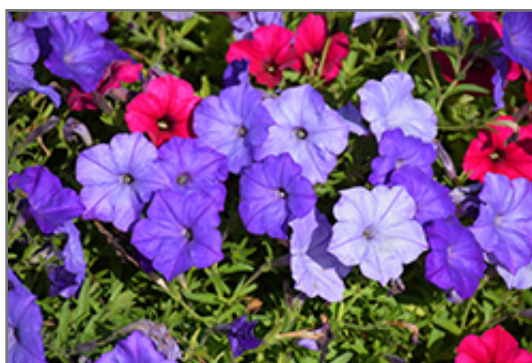
Easy Wave Lavender Sky Blue Petunia flowers