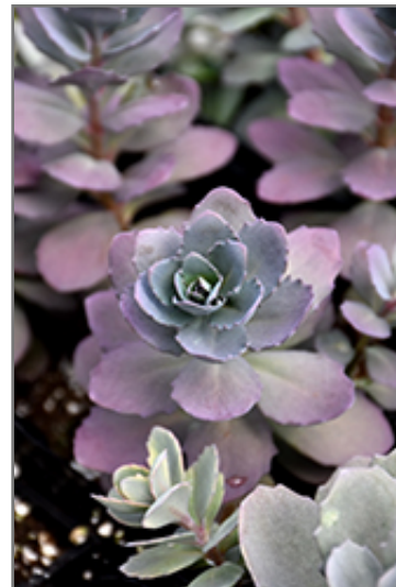
Plum Dazzled Stonecrop foliage