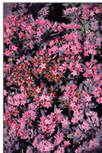
Plum Dazzled Stonecrop flowers

Plum Dazzled Stonecrop is a dense herbaceous perennial with an upright spreading habit of growth. Its medium texture blends into the garden, but can always be balanced by a couple of finer or coarser plants for an effective composition.