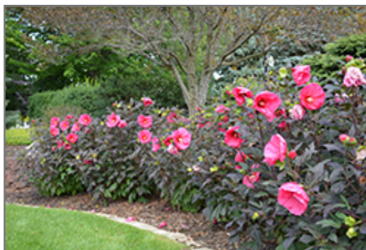
Summerific Evening Rose Hibiscus in bloom