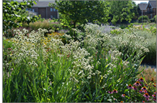
Rattlesnake Master in bloom

Rattlesnake Master will grow to be about 24 inches tall at maturity extending to 4 feet tall with the flowers, with a spread of 3 feet. Its foliage tends to remain dense right to the ground, not requiring facer plants in front. It grows at a medium rate, and under ideal conditions can be expected to live for approximately 10 years. As an herbaceous perennial, this plant will usually die back to the crown each winter, and will regrow from the base each spring. Be careful not to disturb the crown in late winter when it may not be readily seen!