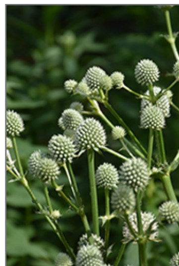
Rattlesnake Master flowers

Rattlesnake Master is recommended for the following landscape applications;