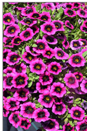
Superbells Blackcurrent Punch Calibrachoa flowers

Superbells Blackcurrent Punch Calibrachoa is recommended for the following landscape applications;