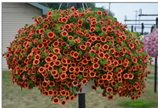
Superbells Tangerine Punch Calibrachoa in bloom