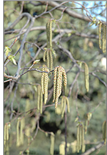
Hop Hornbeam flowers

* This is a 'special order' plant - contact store for details