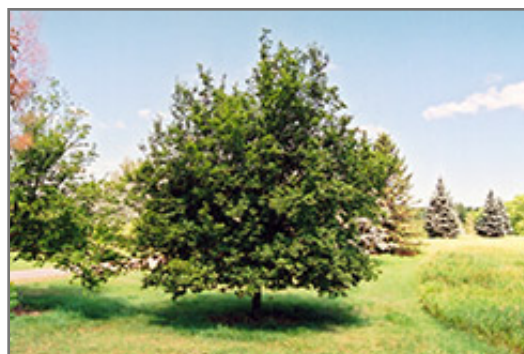
Hop Hornbeam