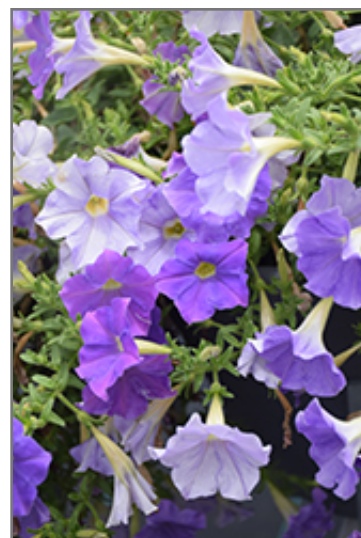
Supertunia Blue Skies Petunia flowers

Supertunia Blue Skies Petunia is recommended for the following landscape applications;