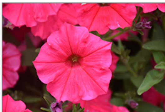
Supertunia Vista Paradise Petunia flowers

Supertunia Vista Paradise Petunia is recommended for the following landscape applications;