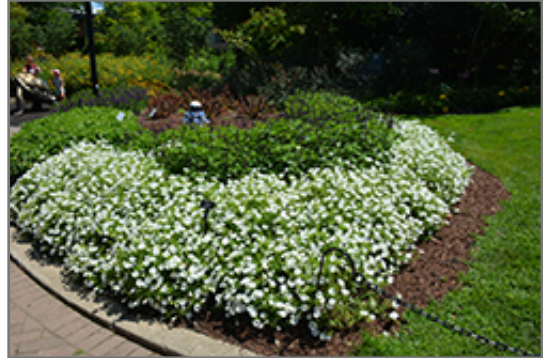
Supertunia Vista Snowdrift Petunia in bloom

Supertunia Vista Snowdrift Petunia will grow to be about 24 inches tall at maturity, with a spread of 3 feet. When grown in masses or used as a bedding plant, individual plants should be spaced approximately 20 inches apart. Its foliage tends to remain dense right to the ground, not requiring facer plants in front. This fast-growing annual will normally live for one full growing season, needing replacement the following year.