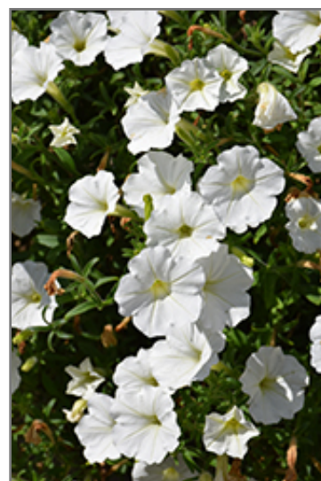
Supertunia Vista Snowdrift Petunia flowers