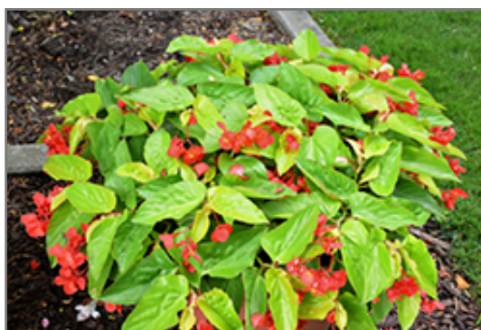
Canary Wings Begonia in bloom