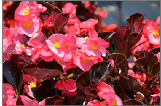
Viking Pink on Chocolate Begonia flowers