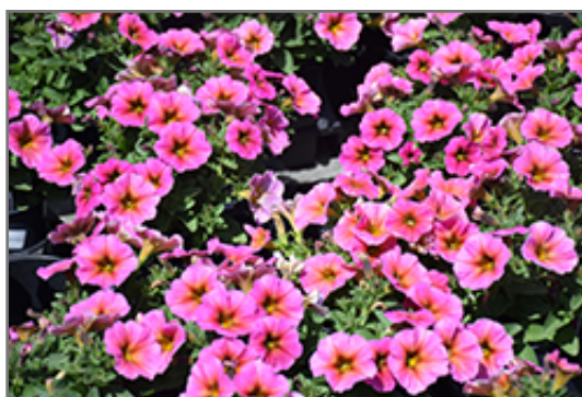
SuperCal Premium Sunray Pink Petchoa in bloom