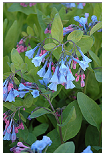
Virginia Bluebells flowers

Virginia Bluebells will grow to be about 18 inches tall at maturity, with a spread of 18 inches. Its foliage tends to remain dense right to the ground, not requiring facer plants in front. It grows at a medium rate, and under ideal conditions can be expected to live for approximately 5 years. As an herbaceous perennial, this plant will usually die back to the crown each winter, and will regrow from the base each spring. Be careful not to disturb the crown in late winter when it may not be readily seen! As this plant tends to go dormant in summer, it is best interplanted with late-season bloomers to hide the dying foliage.