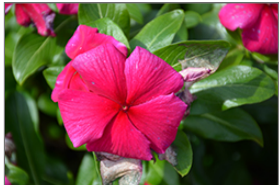
Cora XDR Hotgenta flowers