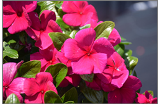
Cora XDR Hotgenta flowers

Cora XDR Hotgenta is recommended for the following landscape applications;