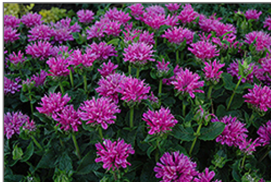
Petite Delight Beebalm flowers