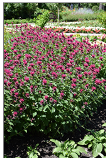
Raspberry Wine Beebalm in bloom