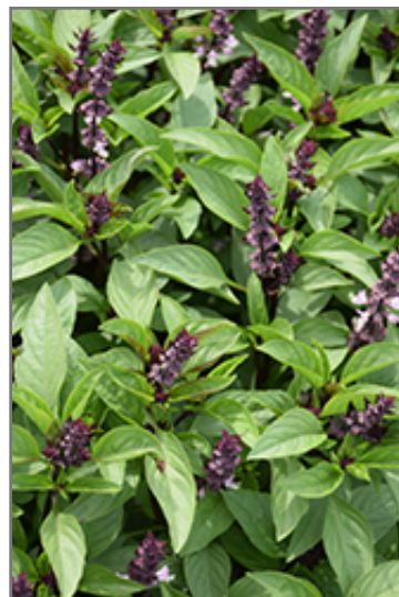
Sweet Basil flowers

Sweet Basil is a good choice for the edible garden, but it is also well-suited for use in outdoor pots and containers. It is often used as a 'filler' in the 'spiller-thriller-filler' container combination, providing the canvas against which the larger thriller plants stand out. Note that when growing plants in outdoor containers and baskets, they may require more frequent waterings than they would in the yard or garden.