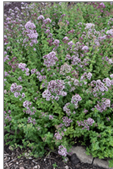
Oregano flowers