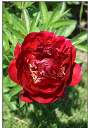
Buckeye Belle Peony flowers