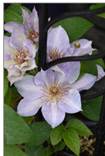
Tranquilite Clematis flowers