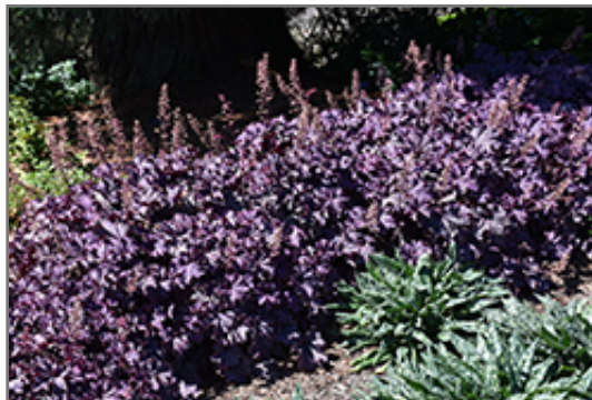
Grande Amethyst Coral Bells in bloom