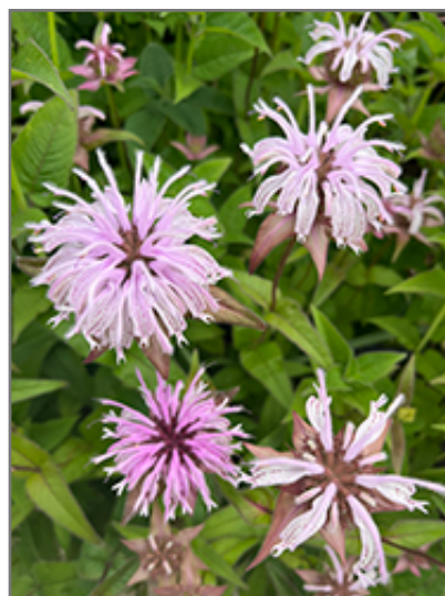
Eastern Beebalm flowers

Eastern Beebalm is recommended for the following landscape applications;