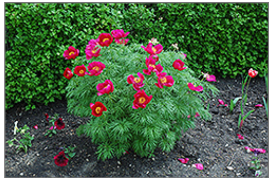
Fernleaf Peony in bloom