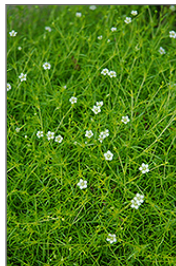
Scotch Moss flowers

Scotch Moss will grow to be only 1 inch tall at maturity, with a spread of 12 inches. Its foliage tends to remain low and dense right to the ground. It grows at a medium rate, and under ideal conditions can be expected to live for approximately 10 years. As an evergreen perennial, this plant will typically keep its form and foliage year-round.