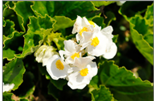
Big White Green Leaf Begonia flowers

Big White Green Leaf Begonia is recommended for the following landscape applications;