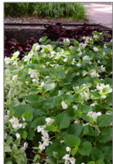
Big White Green Leaf Begonia in bloom