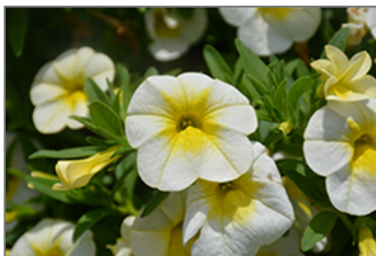
Cha-Cha Frosty Lemon Calibrachoa flowers