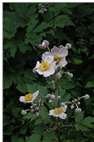
Grapeleaf Anemone flowers