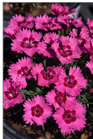
Paint The Town Fancy Pinks flowers

Paint The Town Fancy Pinks is recommended for the following landscape applications;