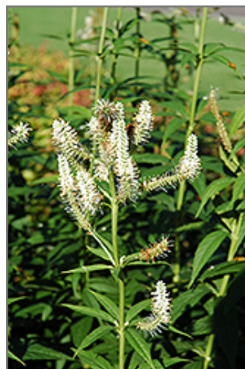
Culver's Root flowers

Culver's Root will grow to be about 3 feet tall at maturity extending to 4 feet tall with the flowers, with a spread of 3 feet. When grown in masses or used as a bedding plant, individual plants should be spaced approximately 30 inches apart. It tends to be leggy, with a typical clearance of 1 foot from the ground, and should be underplanted with lower-growing perennials. It grows at a fast rate, and under ideal conditions can be expected to live for approximately 10 years. As an herbaceous perennial, this plant will usually die back to the crown each winter, and will regrow from the base each spring. Be careful not to disturb the crown in late winter when it may not be readily seen!