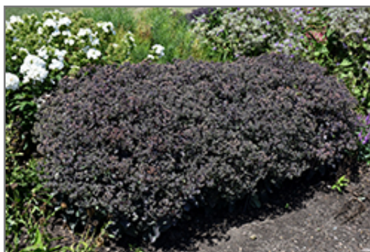
Night Light Stonecrop in bloom

Night Light Stonecrop is recommended for the following landscape applications;