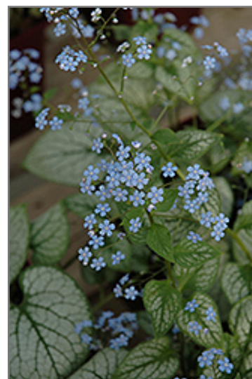
Jack Frost Bugloss flowers