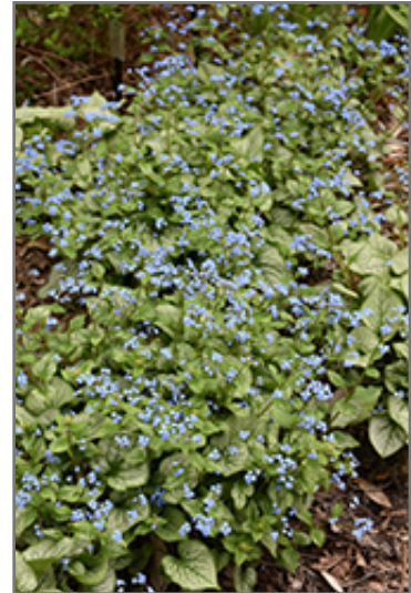
Jack Frost Bugloss in bloom

Jack Frost Bugloss is a fine choice for the garden, but it is also a good selection for planting in outdoor pots and containers. It is often used as a 'filler' in the 'spiller-thriller-filler' container combination, providing a mass of flowers and foliage against which the thriller plants stand out. Note that when growing plants in outdoor containers and baskets, they may require more frequent waterings than they would in the yard or garden. Be aware that in our climate, most plants cannot be expected to survive the winter if left in containers outdoors, and this plant is no exception. Contact our experts for more information on how to protect it over the winter months.