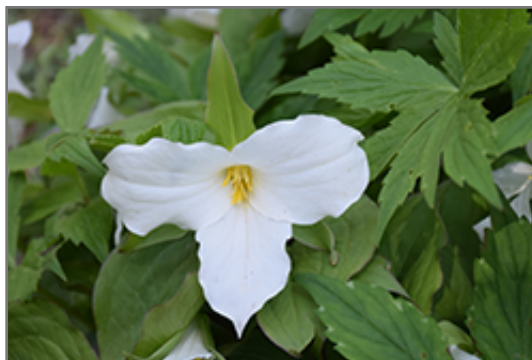
Great White Trillium flowers