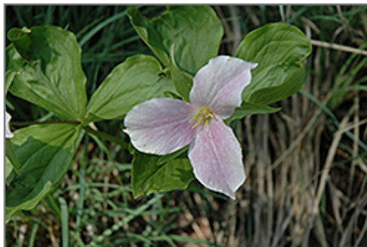
Great White Trillium flowers (faded)