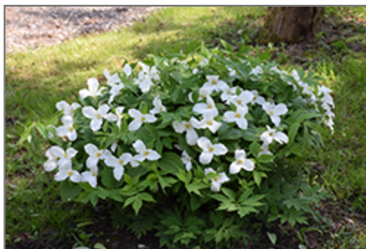
Great White Trillium in bloom