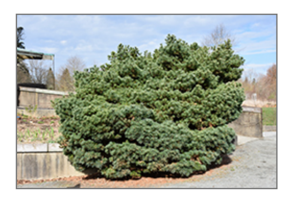
Blue Shag White Pine

3352 N Service Dr. Red Wing, MN, 55066 phone: 651-388-3847 www.sargentsnursery.com