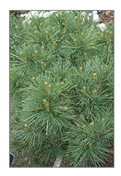
Blue Shag White Pine foliage