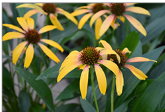
Fiery Meadow Mama Coneflower flowers