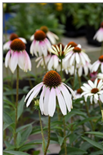
Pretty Parasols Coneflower flowers