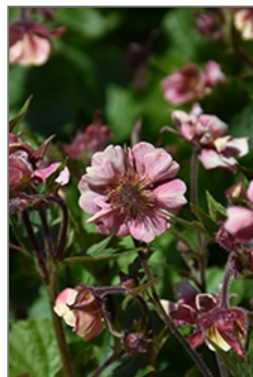
Tempo Rose Avens flowers