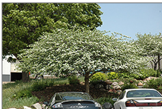
Thornless Cockspur Hawthorn in bloom

Thornless Cockspur Hawthorn will grow to be about 25 feet tall at maturity, with a spread of 25 feet. It has a low canopy with a typical clearance of 3 feet from the ground, and is suitable for planting under power lines. It grows at a slow rate, and under ideal conditions can be expected to live for 50 years or more.