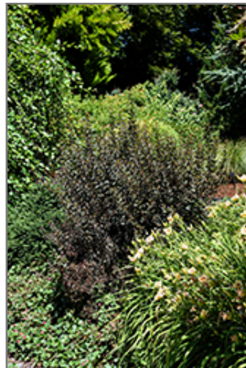
Little Joker Ninebark