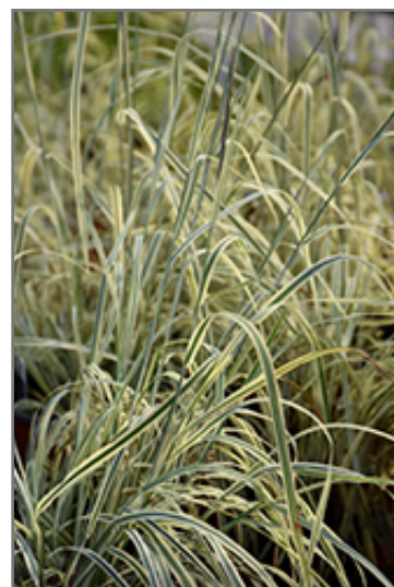
Shining Star Bluestem foliage

Shining Star Bluestem is recommended for the following landscape applications;