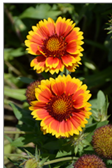
Arizona Sun Blanket Flower flowers

Arizona Sun Blanket Flower is recommended for the following landscape applications;