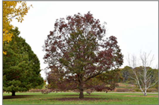
White Oak in fall

* This is a 'special order' plant - contact store for details