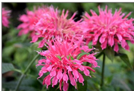
Coral Reef Beebalm flowers