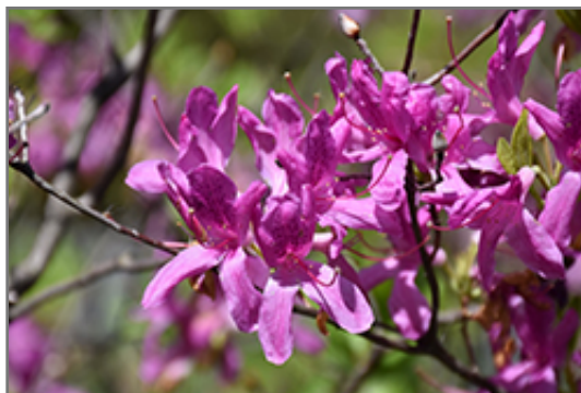
Lilac Lights Azalea flowers